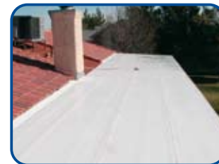
Las Vegas, NV